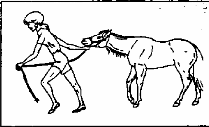
There is a wrong way.....